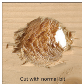
Cut with normal bit