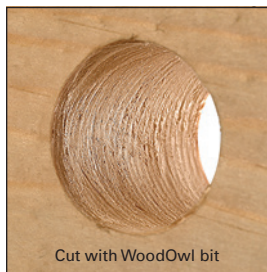
Cut with WoodOwl bit