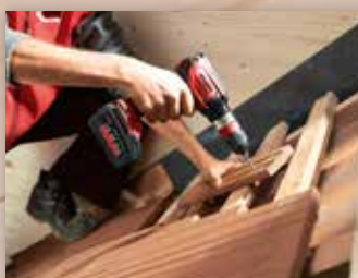
3 IN 1 - THE ASB18 M BL

Equipped with a max. 50 mm auger bit and the auxiliary handle, the A18 M bl and ASB18 M bl readily perform even tough drilling duties in wood.