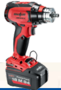
ASB18 M bl

High-performance 18 V model for professional users.