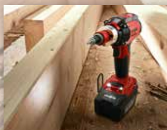
LED WORK LAMP

The cordless ASB18 M bl combines three machines in one: a driver, a conventional drill, and a percussion drill, offering carpenters even greater flexibility and independence as they go about their work.