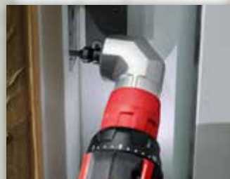
BATTERY CHARGE INDICATOR

Thanks to the clever angle head, screws can be tightened easily, even in confined spaces.