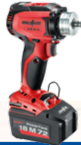
A18 M bl

Handy 10.8 V model for internal finishing work.