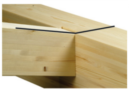
Rafter to base plate (wall beam)