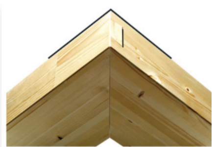
Rafter-to-rafter (without ridge purlin)

The fences are tilting at +50°/90°/-50°, and are height-adjustable with very precise sliding fences.